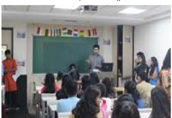
Celebration of World Tourism Day