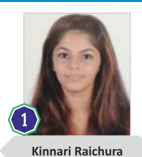
Accounting & Auditing