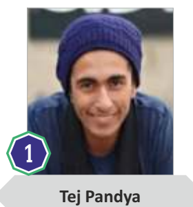
Travel & Tourism