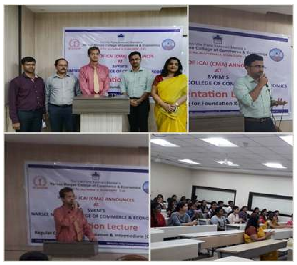
Orientation Lecture of CMA Foundation and Intermediate Students

A fresh batch of NSE Certified Capital Market Professional Course started from 4th February, 2018, Viva Voce exam for the same was conducted on 21st April, 2018 and exams were conducted by NSE Academy on 5th May, 2018. Total sixteen students enrolled for the same.