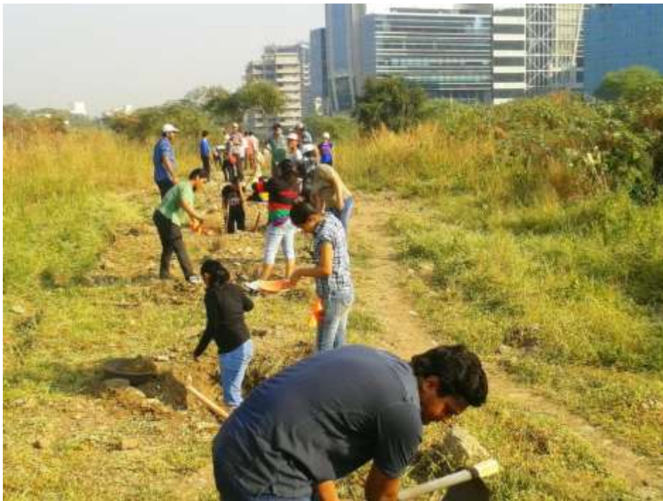
TREE PLANTATION AT MUMBAI UNIVERSITY