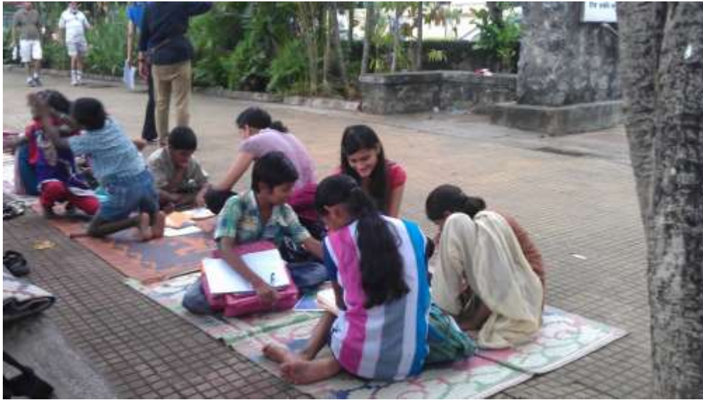
TEACHING SLUM KIDS AT CARTERS ROAD