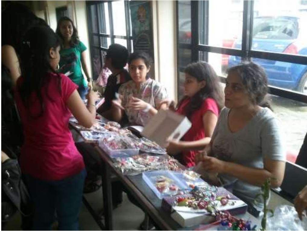
RAKHI SELLING AT COLLEGE