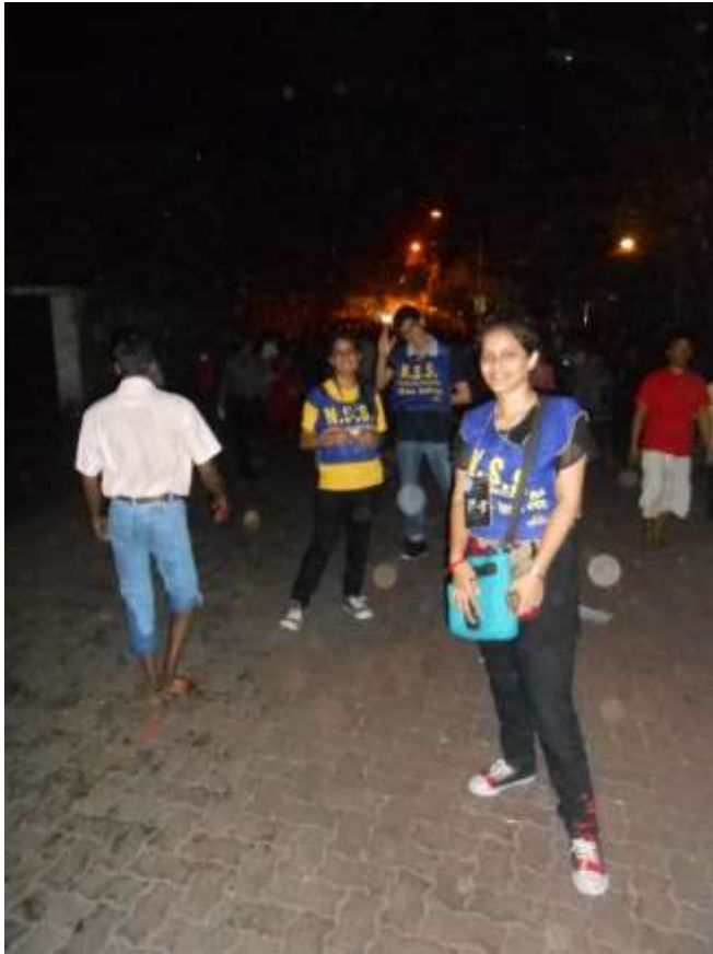
STUDENT POLICE INTERACTION