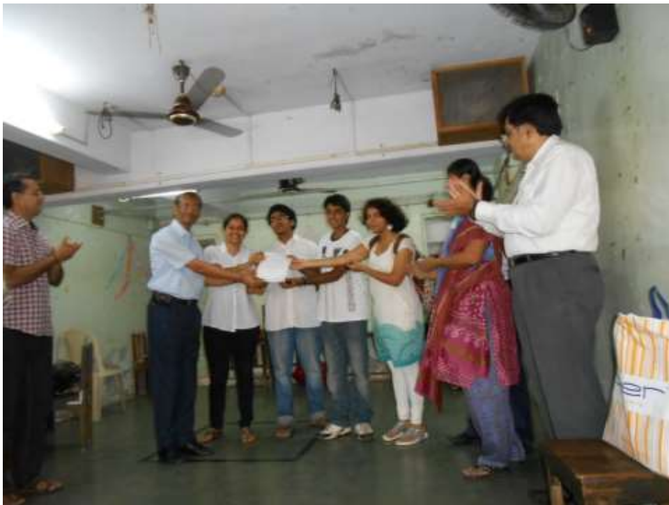
FELICITATION AT VDI- for the highest sales by a college