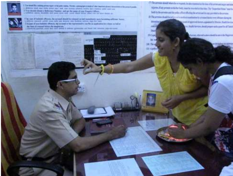
RAKHI CELEBRATIONS AT JUHU POLICE STATION